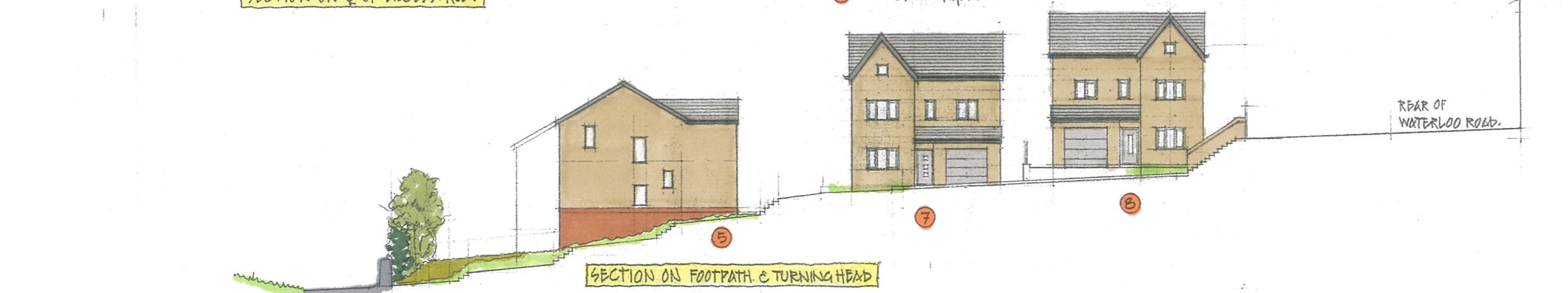
SECTION ON FOOTPATH & TURNING HEAD