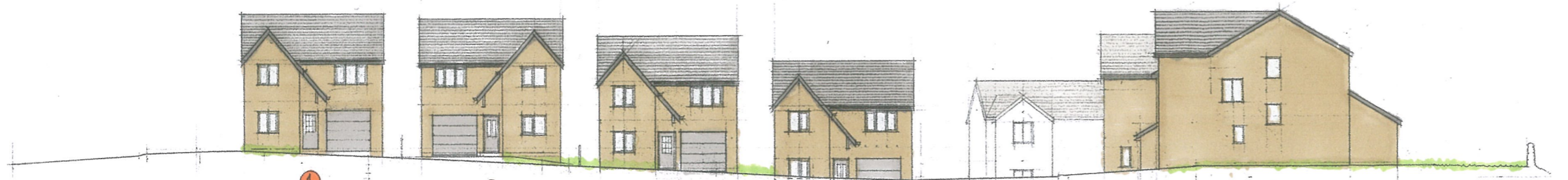
SECTION ON C. OF ACCESS. ROAD