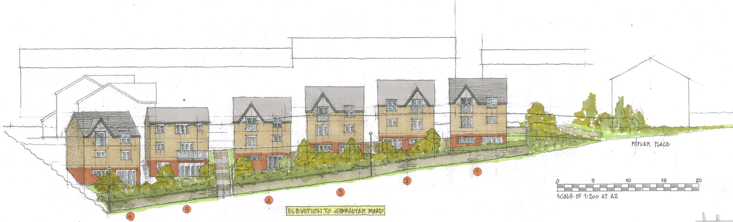
ELEVATION TO GIBRALTAR ROAD